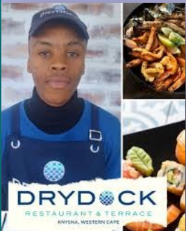
DRY DOCK RESTAURANT & TERRACE KNYSNA, WESTERN CAPE