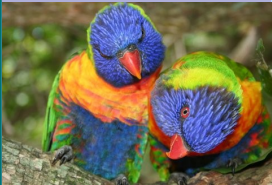
BIRDS OF EDEN