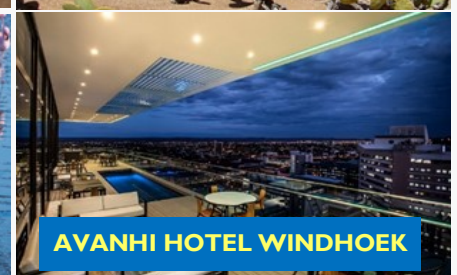
AVANI HOTEL WINDHOEK

Bookings: 7 confirmed: If you want to join this tour please confirm asap.