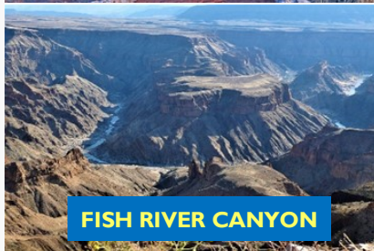
FISH RIVER CANYON