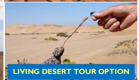
LIVING DESERT TOUR OPTION