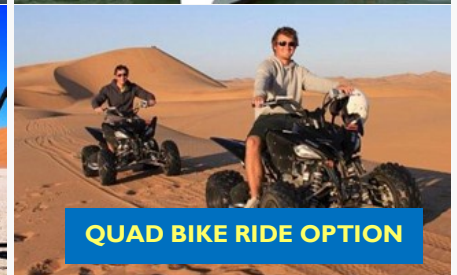
QUAD BIKE RIDE OPTION