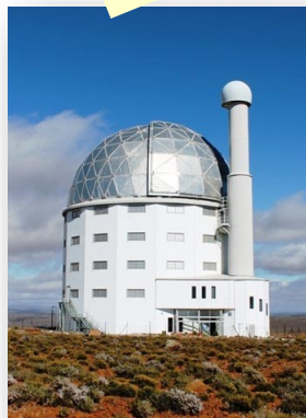
SALT: South African Large Telescope

One GOOD thing at present is that the Western Cape seems to have an 'old fashioned type' winter with our rains in plentiful supply.