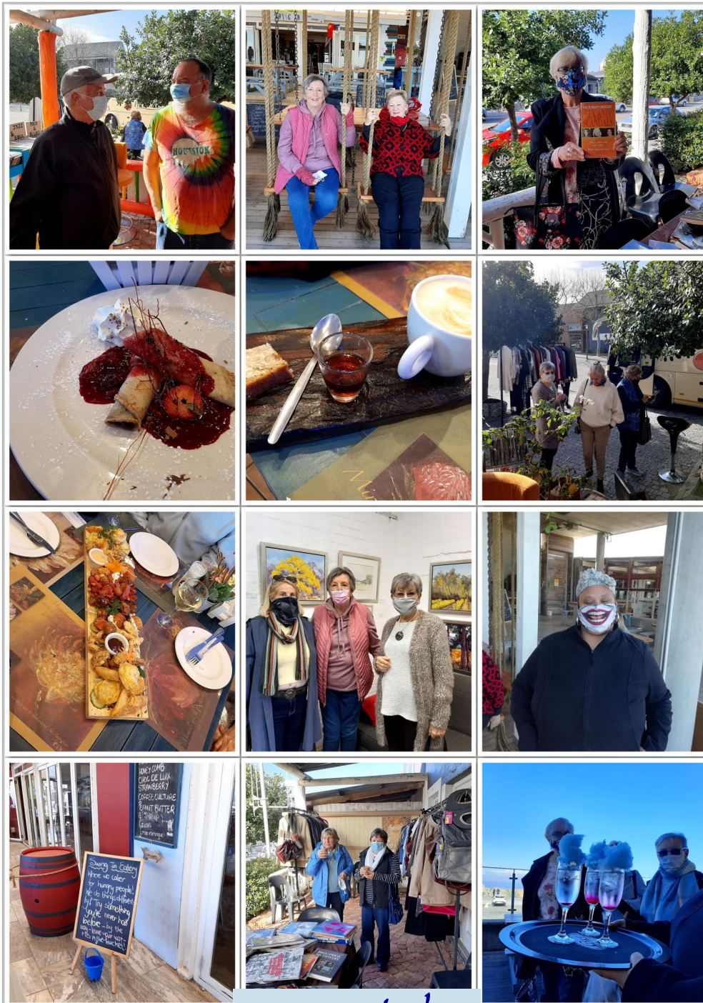
KLEINMOND in June