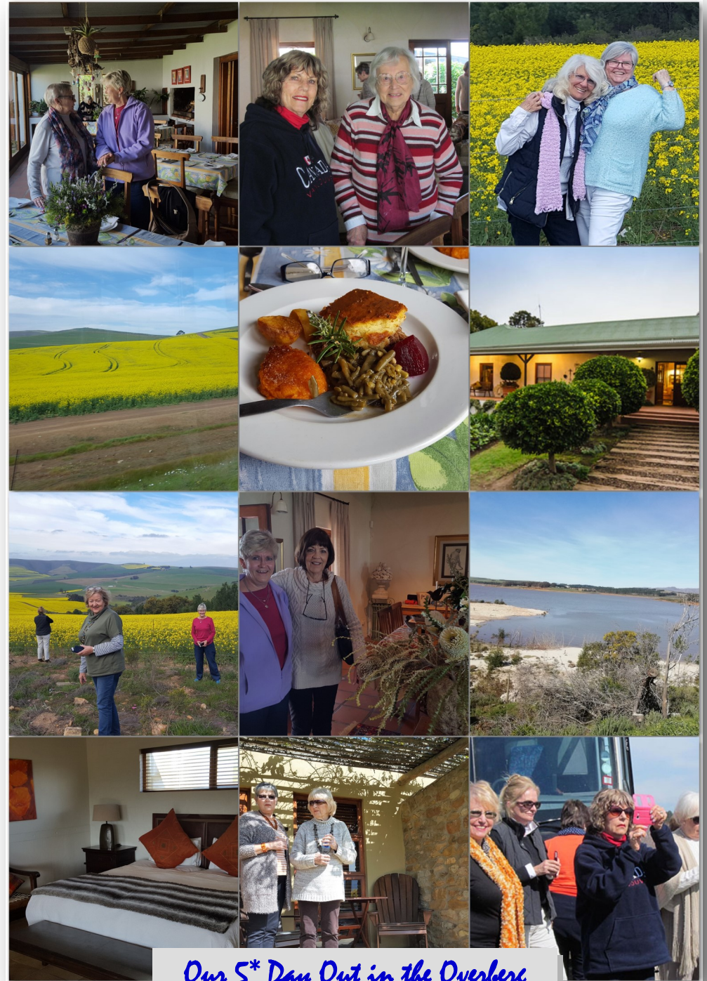
Our 5* Day Out in the Overberg