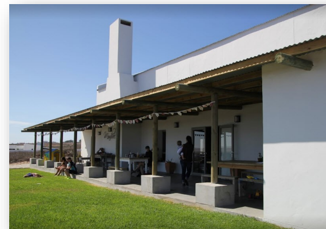
The NEW Mondvol Restaurant outside Paternoster

Our day on the 31st May will allow some time to browse the village of Paternoster. We should arrive there by about 11h15 - this will give you enough time to have a coffee / a short stroll along the beach, and by 12h30 we will head out of town to MONDVOL . Here Alex and Charmaine have opened a new restaurant cum coffee shop'. Remember how they treated us when we visited them in 2013 at their old restaurant, on the way to Trekkoskraal (along that sand road!!). Now they have moved closer to Paternoster and I believe it's good to support this young couple in their new venture!