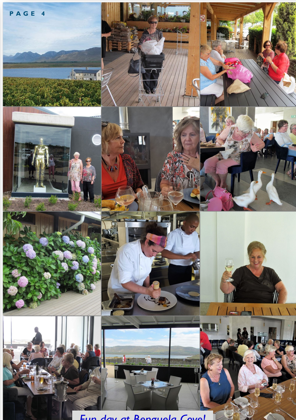
Fun day at Benguela Cove!