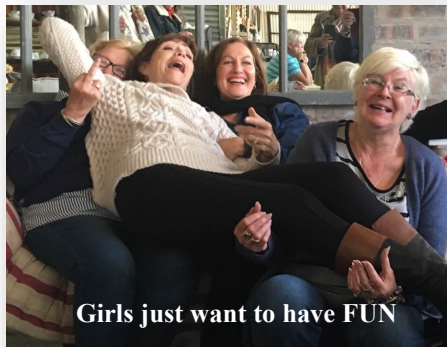
Girls just want to have FUN