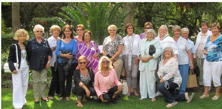
What a happy photo—some stayed in the gardens—others went shopping & church visiting!

With the Stellenbosch vineyards right next door to the restaurant many did wine tasting (buying)!!! Some very happy, contented ladies left the estate at 15h15 bound for the city!