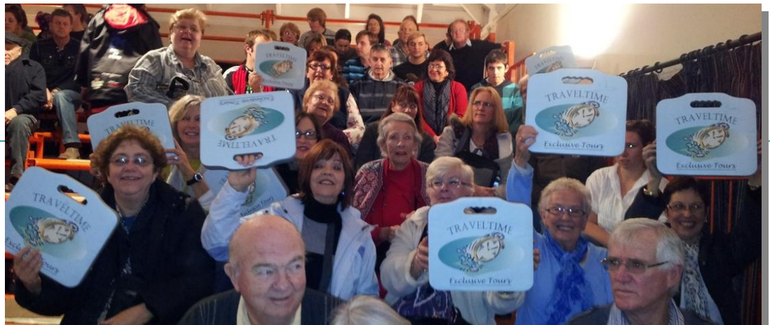
Part of our 2012 tour group during a performance of Big Boys Don't Dance at the Highlander

Don't travel alone, travel in a group to experience the full benefit of companionship & fun.