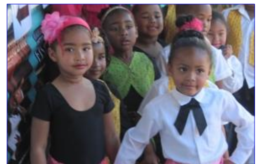
Local children who took part in the parade.

There was enough time to get something to eat and drink before we returned to Cape Town just after 3.30pm. A thoroughly enjoyable day spent in Darling. Diarize next year's performances—5th, 6th and 7th September, 2014.