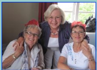
Mystery Venue Tour — this photo was taken on Driefontein farm— December 2011