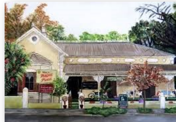
The Perfect Place Restaurant in Wellington