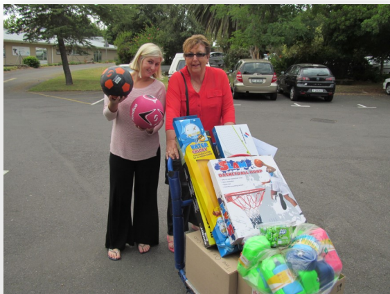
The Time Out donation being delivered to Durbanville Children's Home in 2014.

I will, once again, purchase school stationery kits for the start of the new term for the children. If you wish to donate, you are welcome to just pay the money as you would for tours - just mark the EFT " Durbanville Childrens Home "