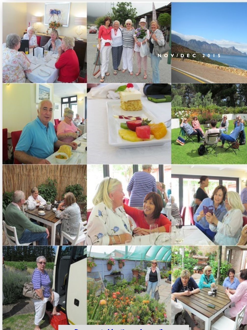
Rivendell: October 2015