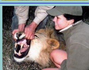
Lalibela Game Reserve (October)-Details in July Newsletter