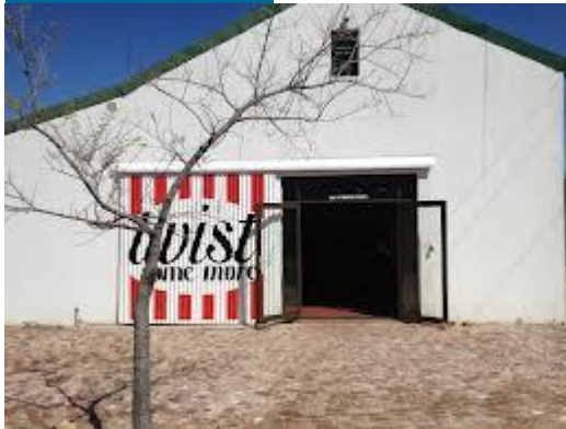
The TWIST SOME MORE Restaurant outside Wellington.