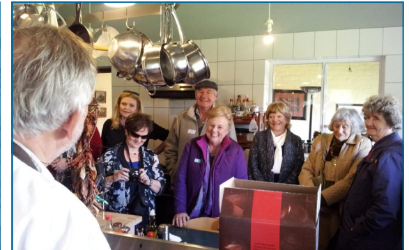
"In the kitchen, understanding the art of chocolate making"