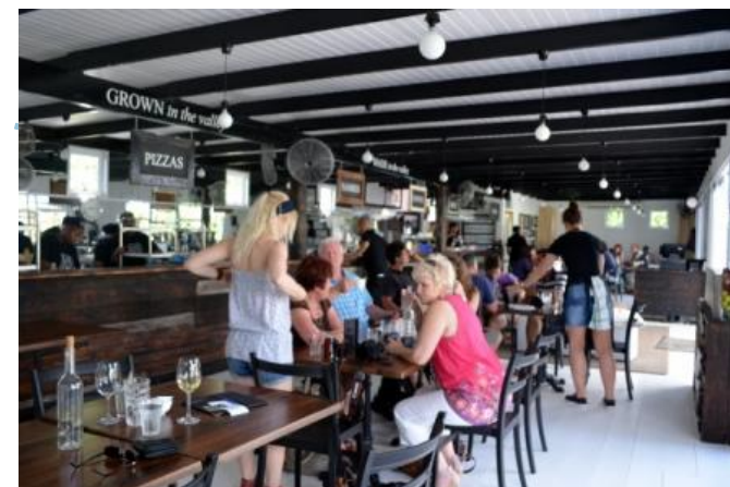
CAFÉ BLANC DE NOIR

I am still in the planning stage of what we will do in the morning en route to Brenaissance. I just have not had replies to the emails I've sent out. So, at the moment I am not able to confirm this.