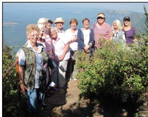
The 11 of us at God's Window