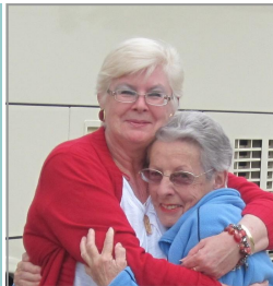
A HUG ALWAYS FEELS GOOD

A Great day to enjoy our City and Friends